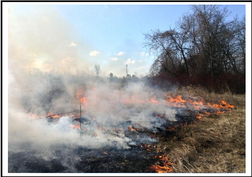
Figure 2: Controlled Burn in Tall Grass Prairie in April

We invite everyone with interest and energy, to join us on Earth Day to help out with these projects!