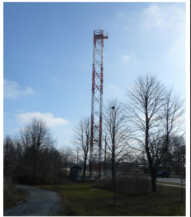
Figure 1: New Range Tower March 2013

If you've had an opportunity to walk through the park this winter you would have noticed a lot of activity around the St. Lawrence Seaway Authority Range Tower. We are happy to report the Seaway Authority has been very accommodating and has installed a new tower ( Figure 1 ). This is significantly higher than the previous tower and will mean less impact to the trees within the park. We would like to thank the Seaway Authority and the City of St. Catharines for facilitating a positive outcome to this project.